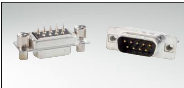
RoHS compliant – CSA listed, File No.: LR 115000-1 – UL listed, File No.: E202784

Solder pin – Straight – Precision machined contacts