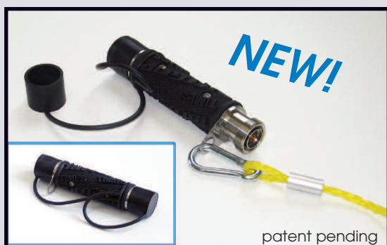
TMA Bypass 7-16 Bullet TuffGrip® Adaptor for Cell Site RF testing PN: 3191-291