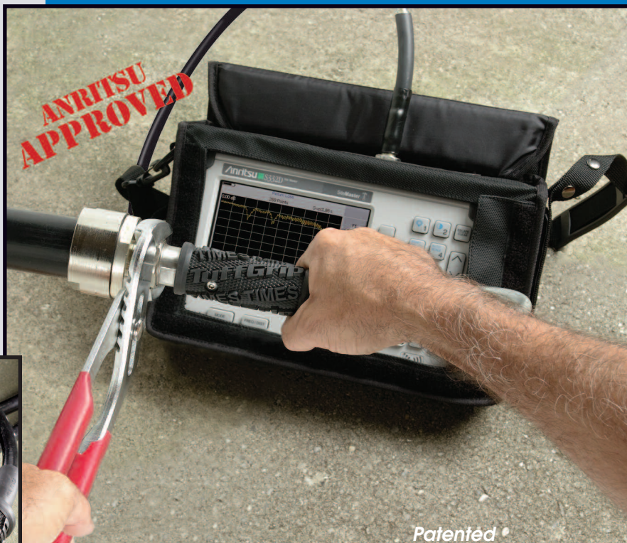
Anritsu SiteMaster™

SilverLine-TG™ (TuffGrip®) test cables are designed for sweep testing cellular infrastructure site cables and antennas. Its unique features were designed by field technicians for field technicians.